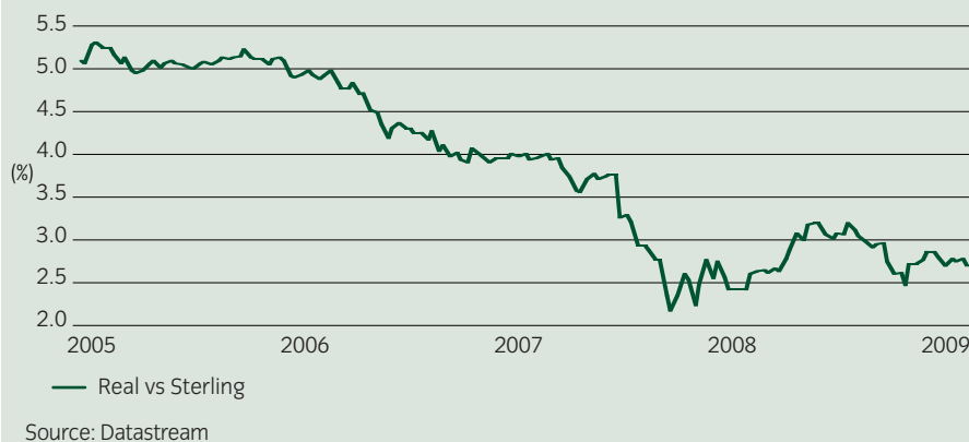
Chart 1: Brazilian Real Relative to Sterling from January 2005 to December 2009

euro clearly reduce the number of currencies available, this is more than offset by improving liquidity in emerging currencies.