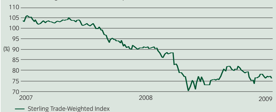
Chart 1: Sterling Broad Index January 2007 to December 2009

Exchange rates are something to which we can all relate. The dramatic devaluation of the British pound against most currencies in 2008 meant UK earners saw their holiday spending power reduced significantly. Chart 1 shows clearly how, relative to a basket of global currencies, the value of sterling has fallen significantly over the past three years. Exchange rates also change the value of foreign investments and are an important risk to consider when investing abroad. UK investors in a German bond would have seen the sterling value of their holding go up by over 40% in 2008 from currency moves alone. European investors in gilts, however, would have actually lost money despite a 30% rise in sterling bond values, due to the UK currency's depreciation. The above examples are tangible evidence of how relative currency values can change. It follows logically that there are