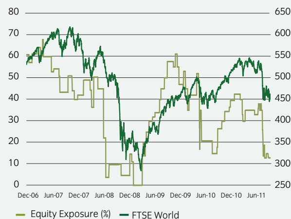
Equity weighting in Insight's Broad Opportunities strategy

Data as at 30 September 2011.