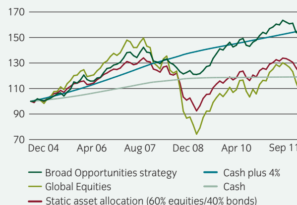
Performance: the Insight Broad Opportunities strategy against comparable assets

Data as at 30 September 2011, US$ hedged.